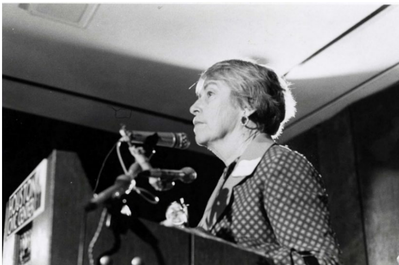
Martha Griffiths speaking at the 1977 Equal Rights Ratification Assembly, part of the 1977 National Woman's Conference in Texas, 11/18/19 17

At this point opposition to the ERA began to organize. 15 Only eight states ratified in 1973, three in 1974, one in 1975, and none in 1976. 1977 saw the first congressionally funded National Women's Conference in Houston, Texas. Two-thousand delegates, from every State, called for ratification of the ERA. 16