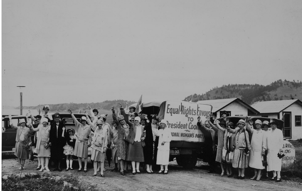
National Woman's Party on their way to Rapid City, South Dakota.

Then, in 1943 Paul proposed an amendment that slightly changed the wording to “Equality of rights under the law shall not be denied or abridged by the United States or by any State on account of sex.” The Amendment was renamed the “Alice Paul Amendment.” ERA, History of the Equal Rights Amendment . 7 The new wording was similar to the verbiage used in the Fourteenth Amendment and was designed to ensure that the new amendment would not remove existing protections for women. Erin Blakemore, Why the fight Over the Equal Rights Amendment Has Lasted Nearly a Century , November 26, 2018. 8 Notably, in the early 1940's both major political parties, Republicans and Democrats, included